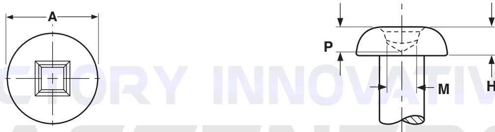
SQUARE RECESS PAN HEADS FOR SELF-TAPPING SCREWS

This type of recess has a square center opening, slightly tapered side walls and a conical bottom.