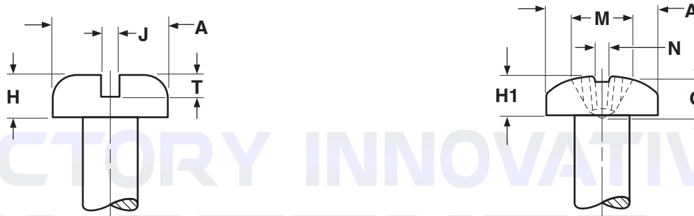
PAN HEADS FOR SELF-TAPPING AND DRILLING SCREWS